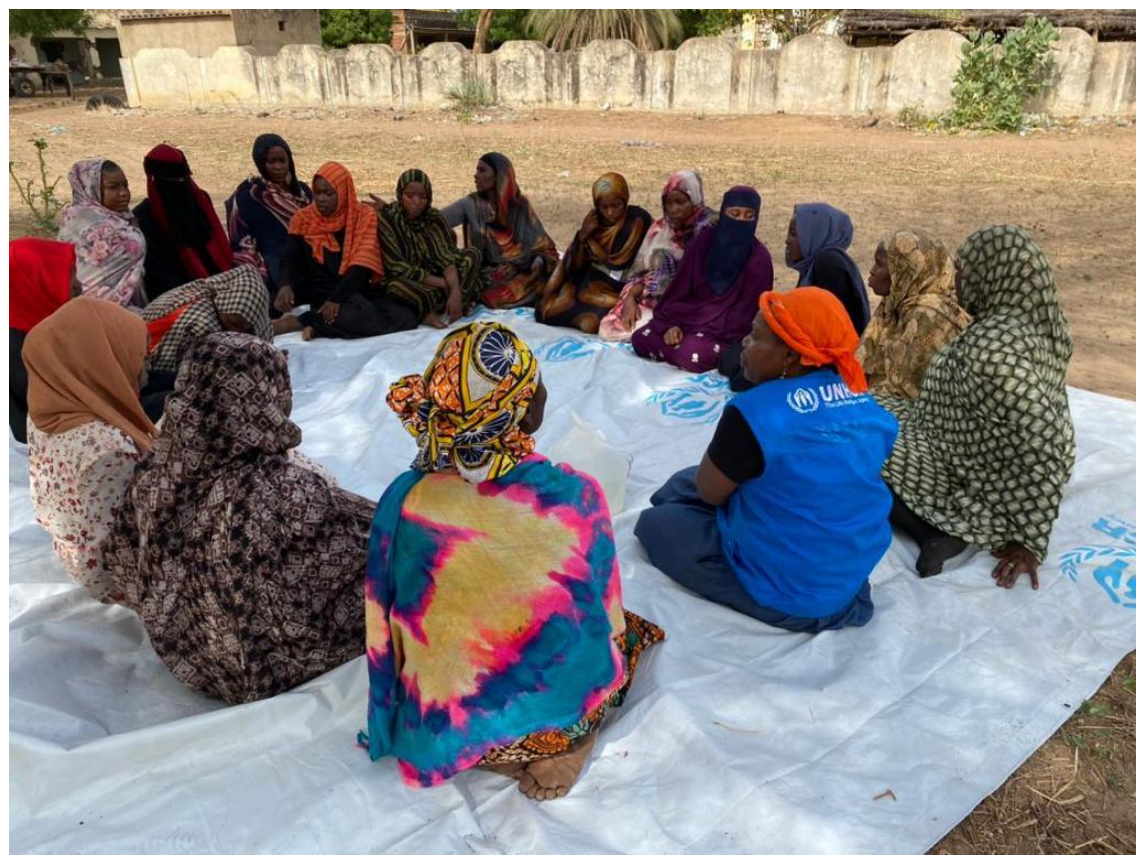
A UNHCR officer having a group psychosocial counseling session in Am Daffock, CAR, with girls and women who have experienced violence and trauma during their flight from Sudan.